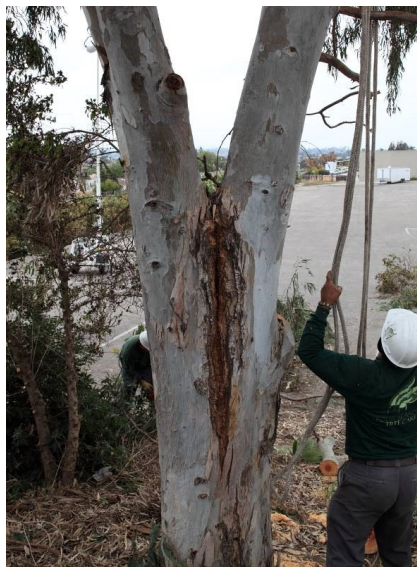
Examples of trees with codominant leaders that should have been structure pruned when young